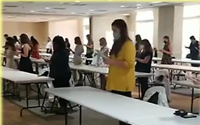
Nursing students recite the Honor in Caring pledge, affirming their commitment to maintain the highest levels of integrity in their clinical practice.