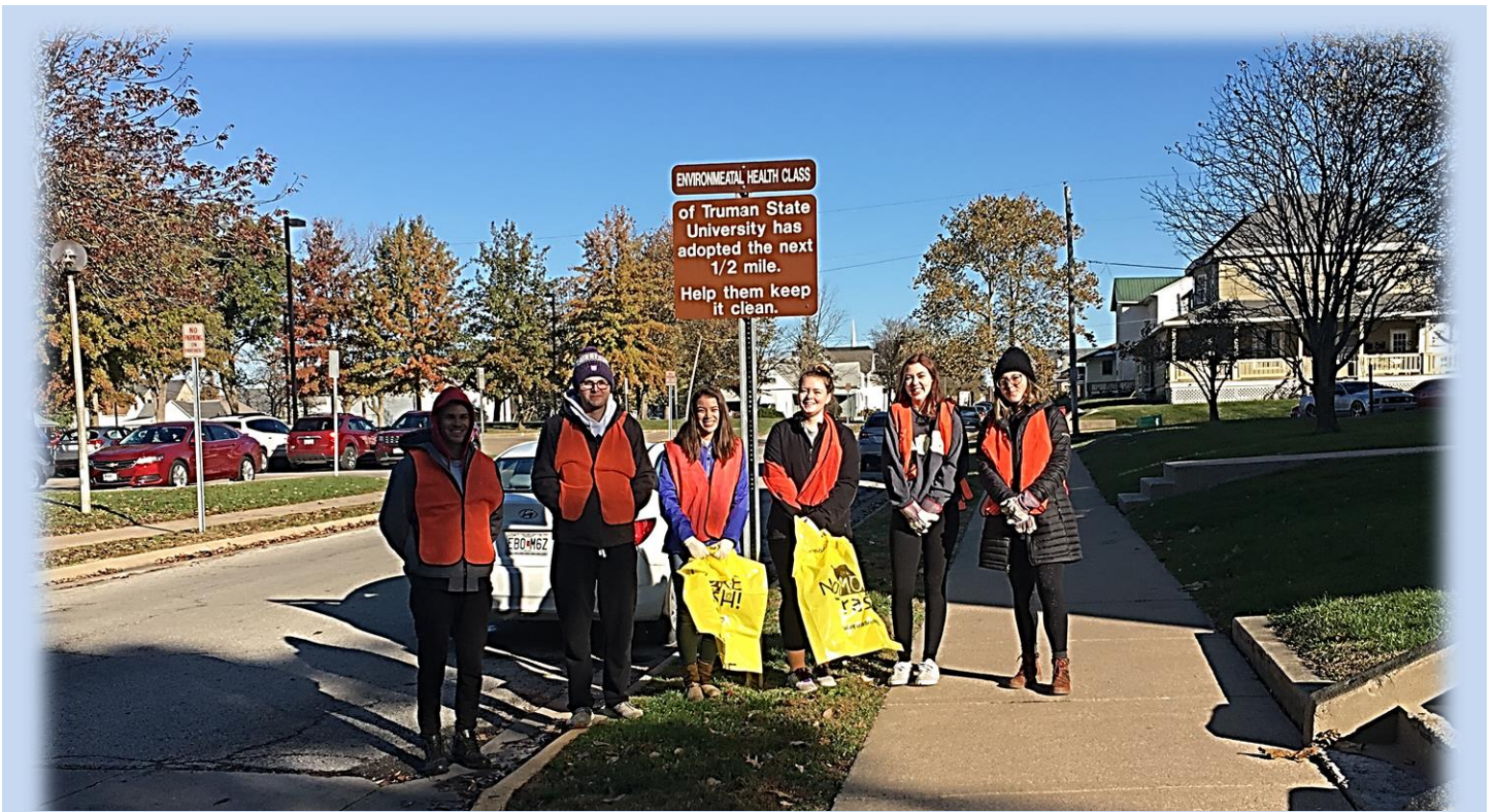
HLTH 362 Environmental Health students are pictured at the last of three street clean-ups during the fall 2019. They cleaned a section of High Street from Normal to Buchanan.