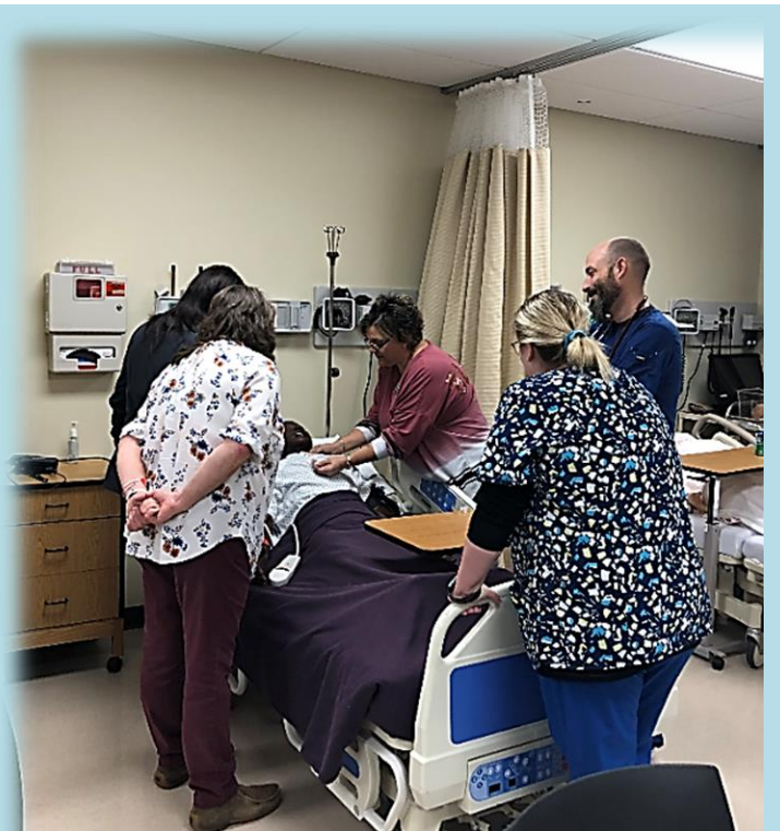
Hospice nurses provide tracheostomy care on the Advanced Life Support Manikin.