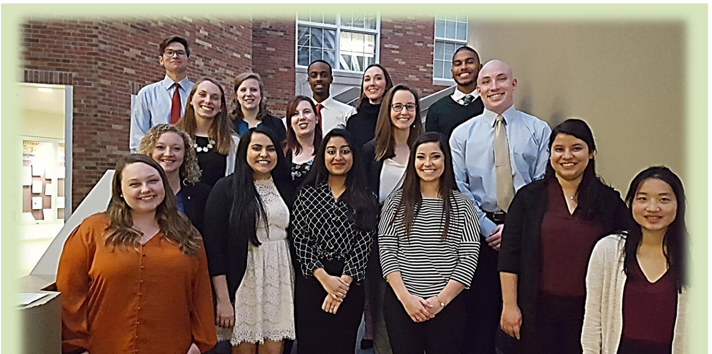
HLTH 440 seniors are pictured at the fall 2019 showcase of capstone presentations.