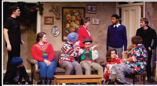
In-Laws, Outlaws, and Other People (That Should Be Shot)

Our program emphasizes practical experience at every level of production. We offer students transformative experiences; students perform, design, direct, choreograph, construct, circuit, paint, sew, write plays, research and teach.