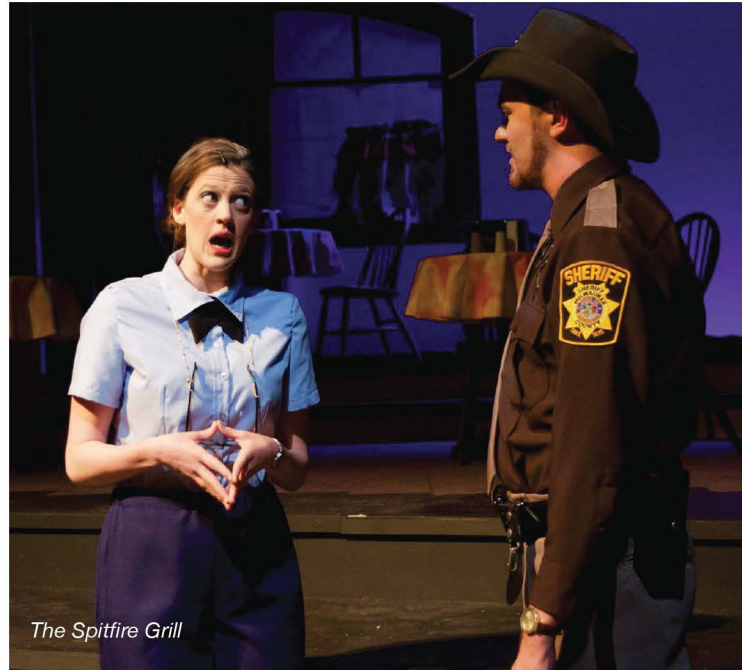
The Spitfire Grill