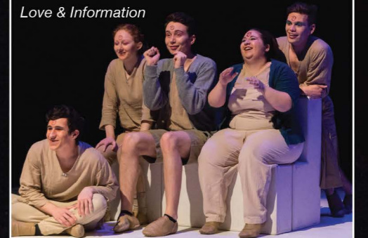
Love & Information