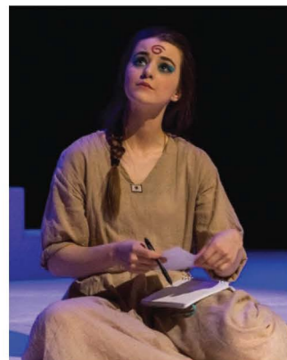
Love & Information