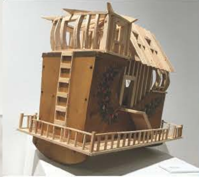
Bethany Shatz, Wood Sculpture