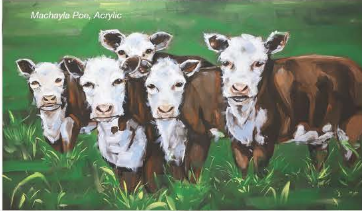
Machayla Poe, Acrylic